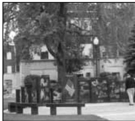
Plymouth Veterans' Memorial Park

Brick pavers are still available for purchase through the Foundation for both the Plymouth Community Veterans' Memorial Park and the