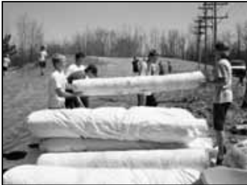
Large rolls of straw were laid out for protection of the grass as it grows.

Most of us dread that knock on the door from the student next door selling candy/stationery/books/cookies to support the baseball team/choir/scout troop/dance team. It's not that we don't want to support the student, it's that we don't need one more thing to eat or gather dust. Well, the Salem High School Baseball team has found a unique and productive way to raise money and give